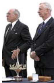
Prime Minister, the Hon John Howard, MP and Sir Daryl Dawson

The Menzies Memorial Trophy was presented by the Prime Minister, the Hon John Howard, MP to Cameron White, Captain of the PM's XI following his team's victory over England.