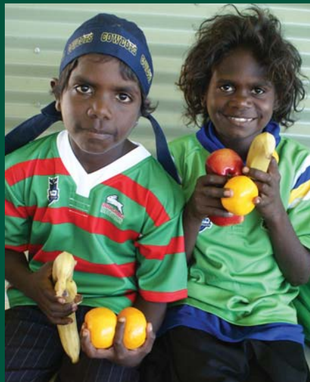
The Menzies School of Health Research thanked families of the Tiwi Islands for their involvement and assistance in research projects over many years.