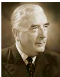
The Rt Hon Sir Robert Menzies, KT, AK, CH, FRS, QC Prime Minister of Australia 1939-1941 and 1949-1966

The Menzies Foundation is governed by a Board of voluntary directors, in accordance with the objectives in its Memorandum of Association. The day to day business of the Foundation is managed by a small secretariat and a part-time salaried Executive Director.